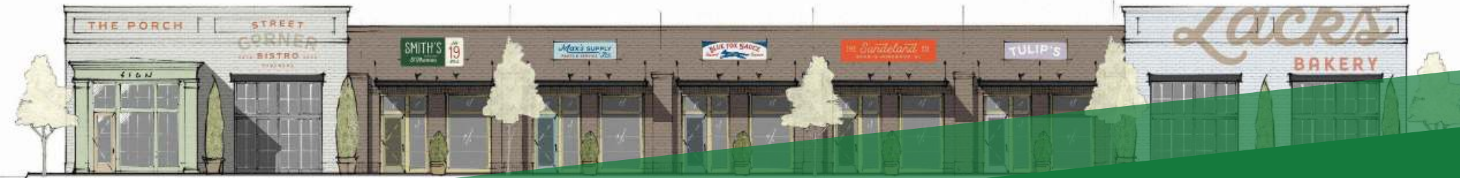
BUILDING ELEVATION B