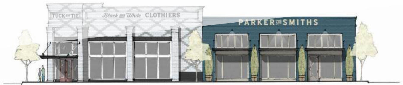
BUILDING ELEVATION A