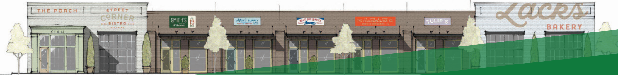
BUILDING ELEVATION B