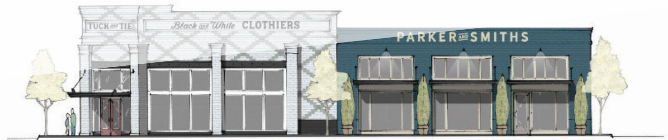
BUILDING ELEVATION A